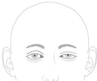
Patient has ptosis in his right eye

ptosis Drooping or displacement of the upper eyelid, caused by paralysis, muscle problems, or outside mechanical forces. Synonym(s): blepharoptosis.